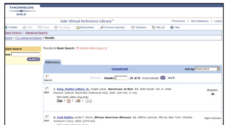
▲ Search results are clearly listed and take the user directly to the source