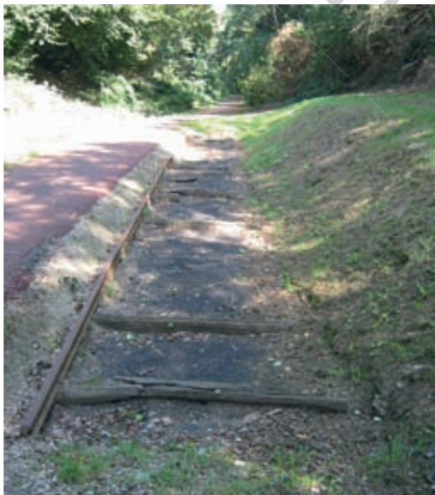
The cutting today, now part of the Australia Walk, which follows the bed of the old track to Zonnebeke.

of catching the barrage, the 9th Brigade was held up for an hour by strongpoints at Augustus Wood, Hillside Farm and Defy Crossing. Though the 34th Battalion was supposed to be in the lead, these strongpoints fell to the 35th Battalion. The Red Line was gained under continuing heavy fire, whereupon the 35th went on to Passchendaele's outskirts. Drastic losses precluded going further. The same fire prevented the 12th Brigade from getting much past the Red Line. Too weak to resist counterattacks, the remnants of the 9th fell back to your location; the 12th to Defy Crossing. Now in danger of being outflanked on both sides, the survivors of the 10th Brigade came back too.